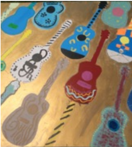
Guitar Mural painted by students last year for the Music Room

S.M.ART Works will meet on Thursdays, beginning October 13.