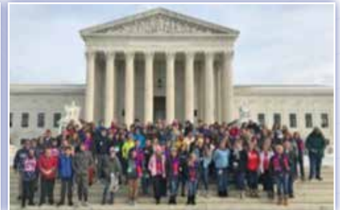
8th grade students and chaperones in front of the U.S. Supreme Court