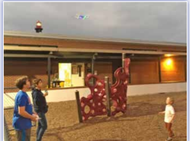
SMS students demonstrate a drone flight at R.B. Hunt's STEM Night.

With a grant from INK! (Investing in Kids!), SMS recently purchased a class set of drones to use in our STEAM elective classes and eventually across disciplines to reinforce learning in a hands-on way. At a STEM Night at R.B. Hunt Elementary School on February 21, students on our Robotics Teams had the opportunity to share their driving and flight skills. In the 4th quarter, our 8th grade students will extend their aerospace knowledge by learning how to operate the drones.