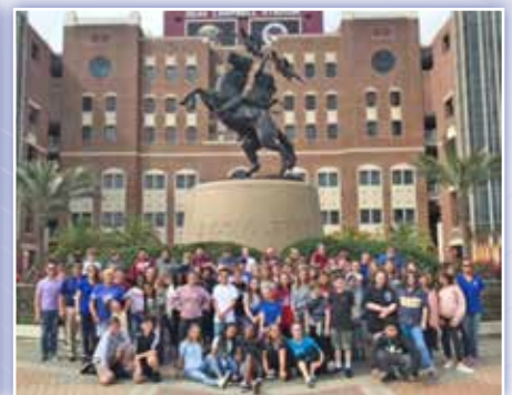
7th Grade students and chaperones visiting FSU's Doak Campbell Stadium.