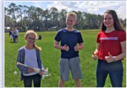
SMS STEAM students give a thumbs up after a successful rocket launch.

On March 1, students in our 8th grade STEAM elective classes concluded a unit on aerospace by launching their fluid-powered rockets on the practice field behind our school. Volunteers from Northrop Grumman were on hand, as they are every Friday, to assist students with a successful launch.