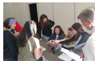
8th grade girls share their tiny house design with parents and district administrators.