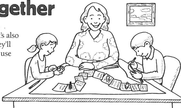
photo shows a toy pirate ship, your child could write, “Nate the pirate set sail with his purple parrot.” If the next picture is of a lemon, you might add, “They landed on a beautiful island with lemon trees.” Finish the story using the last picture.♥

1. Create a board game. Ask your youngster to call out random events (meet a robot, find a treasure, visit a farm). Write each one on a separate sticky note, and let him arrange the notes to make a game board path. Take turns rolling a die and moving a token along the path—using the events you land on to write a story. (“Once upon a time, Kevin met a tall green robot.” “The robot led him to a secret