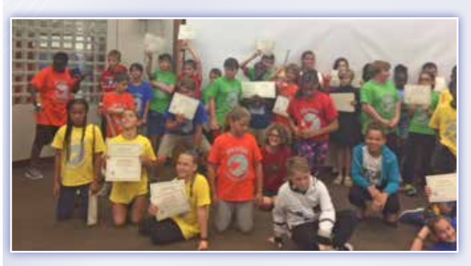
Students show off their "diplomas" on the last day of camp