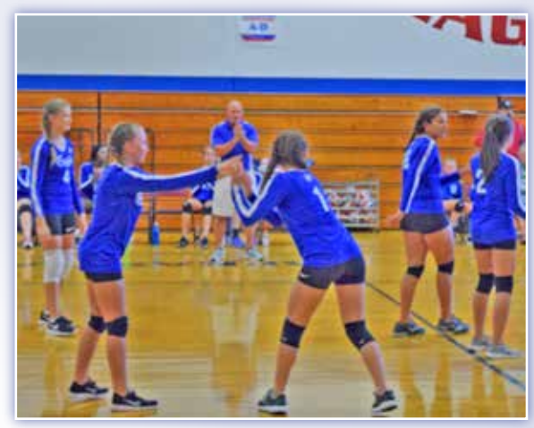
Our Eagle girls high five after scoring!