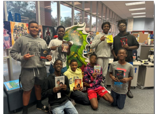
2023-2024 Leaders of Tomorrow