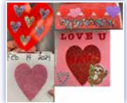
Some of the supplies were used to make Valentines!