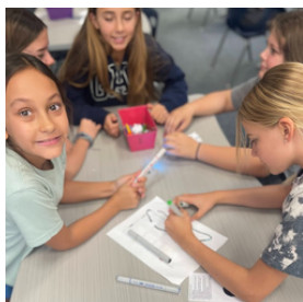
Sixth grade math students reviewed order of operations with the Ozobots and then got to code the Ozobots in a Halloween themed maze.